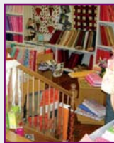
PHOTOS ARE REPRESENTATIVE OF COLUMBUS SHOPPING DESTINATIONS.