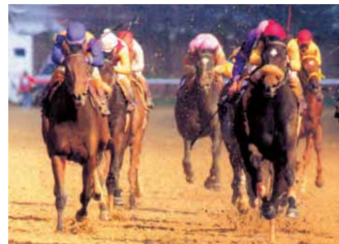
BEULAH PARK THOROUGHBRED RACING 3811 SOUTHWEST BLVD.

Thoroughbred and greyhound racing frequently doubled the population of Grove City with daytime races at Beulah Park and evening greyhound racing. One of the largest evening crowds ever recorded was more than 5,000 people attending a matinee for the greyhound races.