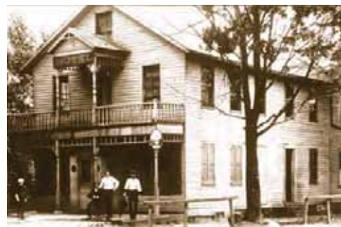
THE OLD HOTEL - 4022 BROADWAY

Today this historic structure is better known as Plank's on Broadway.